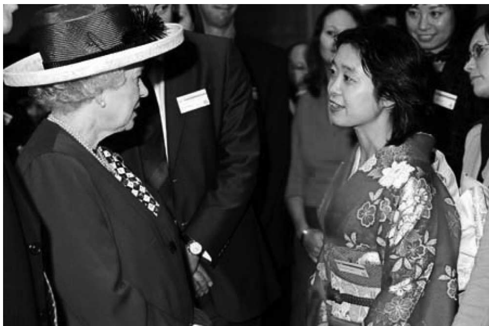
Figure 1. 'The Queen and I': Queen Elizabeth II pictured at the University of Westminster.

At the time, she was working at an English university for a Japanese company that sends students to England. When her university won the Queen's Award for International Enterprise, she was presented to the Queen in traditional, Japanese dress. In the photograph, the Queen has on a striking blue suit and hat, the student has on a beautiful, deep red kimono. They are facing each other, and in that single snapshot they are a vivid portrayal of an encounter between the 'other' (the 'international student') and the ultimate signifier of the former Empire, together celebrating the successes of international trade.